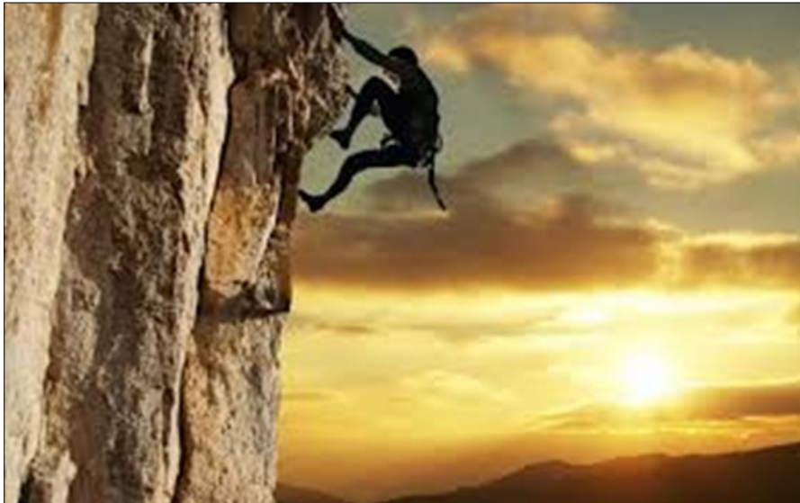
Figure 1. Motivation theme

strong desires in any actions they execute. Highly motivated individuals are such athlete or life time scientists in practice. They continuously work without thinking that how hard a task it could be in order to achieve to their goals. Motivated people have the high level of inspirations by themselves and can be inspired by any factor in space or time [2].